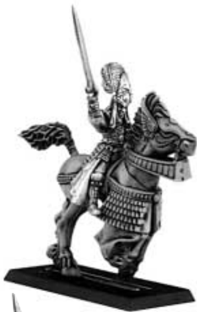
HIGH ELF ELLYRIAN REAVER CHAMPION £4 complete