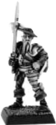
FREELANCE KNIGHT MOUNTED AND ON FOOT - £6 (Includes both models)