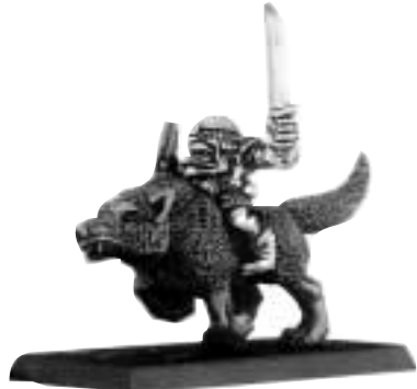
GOBLIN WOLF RIDER £4 Complete